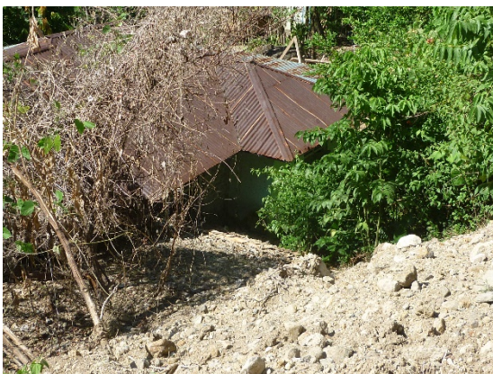
c. Muara Bone Village, Bone