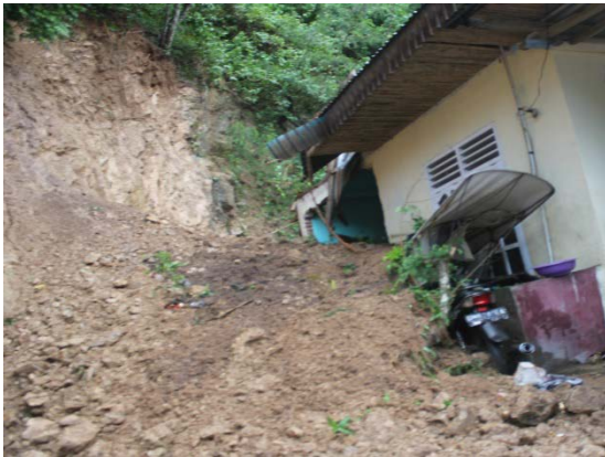
b. Lomaya Village, Bulango Utara