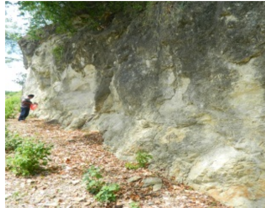
Fig. 4 Rock fall in Tamboo Village, Oluhuta Subdistrict, Bone Bolango Regency.