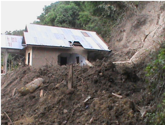
a. Tupa Village, Bulango Utara

to positive. This increases the burden of the slope.