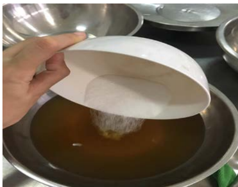
Fig. 9 Addition of mixed ingredients [8]