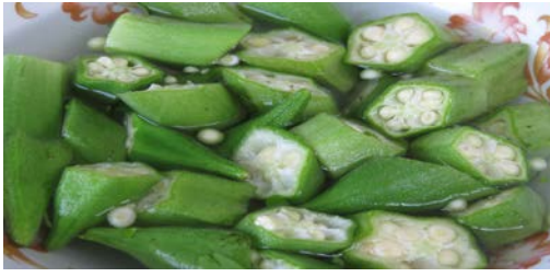
Fig. 1 Fresh okra [8]