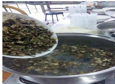
Fig. 6 Okra boiling [8]