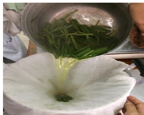
Fig. 8 Aliquot filtration through filter cloth [8]