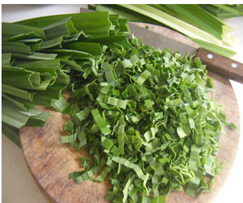
Fig. 4 Sliced pandan leaf [8]