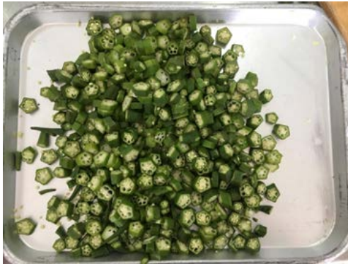
Fig. 2 Piece of okra (before drying) [8]