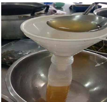
Fig. 10 Hot filling in plastic container [8]