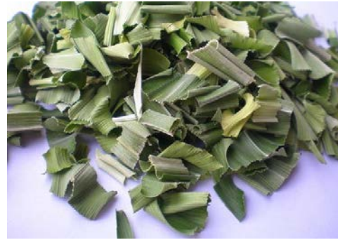
Fig. 5 Dried pandan leaf [8]