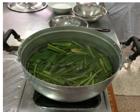
Fig. 7 Pandan leaf boiling [8]