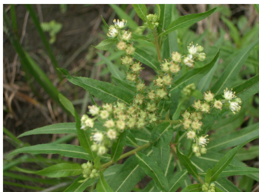
Fig. 1 The flowers of P. chinense .