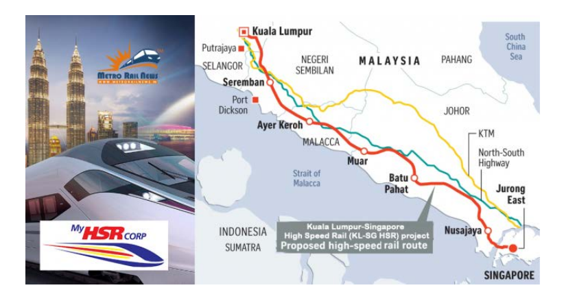
Fig. 5 Proposed Kuala Lumpur – Singapore HSR line [17]

although the relationship has faced some challenges in the past, it has existed since 1965. The Mahathir administration which was in control in Malaysia from 1997 to 2002, was believed by many to be the most stressful period between both Singapore and Malaysia. However, the situation changed after Abdullah Badawi got into power and became the prime minister of Malaysia in 2003, and since then there has been enhanced contact and cooperation between both governments. History is starting to repeat itself again in the part of the SG – KL HSR project [16].