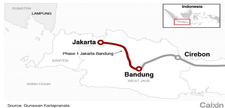
Jakarta-Bandung High-Speed Rail