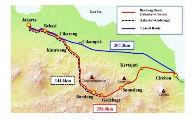
Fig.1 Japanese proposed route [4]

for the government to execute and there were several other more important and significant infrastructural projects that were required in the underdeveloped islands outside of Java.