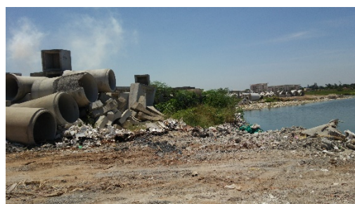
(a) Van Noi landfill in Dong Anh District

Except for collected CDW sent to controlled CDW landfills and marketable materials, other generated CDW is liable to be dumped illegally. The reduction of illegal dumping of CDW is a big challenge to every stakeholder involved, and effective countermeasures to suppress the illegal dumping of CDW in Vietnam are necessary. CDW has great value in reuse and recycling, but recycling of CDW is not yet fully developed in Vietnam.