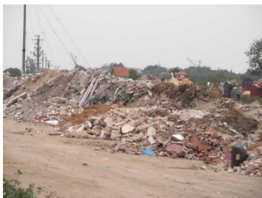
(a) Dumped CDW on the roadside

The illegal dumping of CDW can cause risks to human health and environment, including transportation obstacles (i.e., CDW on roadsides and pavements) leading to accidents, impact on the urban landscape, air pollution (due to dust), soil and groundwater contamination, degraded infrastructure (i.e., blocking sewers and canals), and waste of land. Especially, the illegal dumping of CDW on streets causes countless accidents. The dumped CDW in the canals damages the urban drainage system, becoming a factor in flooding under heavy rainfall.