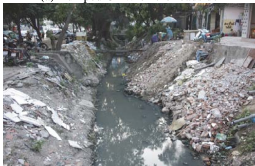
(b) Dumped CDW on drainage canal [12]