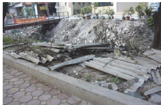
Fig. 5 Illegal dumping of hazardous waste [12]

At most demolition sites, only marketable materials are sorted. Hazardous materials are not separated at sources but dumped illegally together with other CDW. The improper management of hazardous materials like asbestos, waste containing coal tar, and mercury increases the potential risk to human health. The issue of illegal dumping of hazardous waste is mainly due to the cost and lack of treatment facilities.