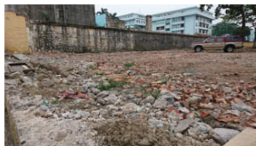
Fig. 6 Material recycled for land reclamation. Crushed brick and concrete are utilized as is (no quality control).