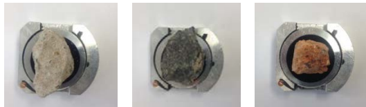
Fig. 2 Studied Rocks from RCA Sample (a) Sedimentary, (b) Igneous, (c) Metamorphic

The variability in the behavior and performance of RCA used in different construction projects indicates the variability in RCA composition. Therefore, this research investigates the composition and variability of recycled construction aggregates through classification of aggregate samples collected from a recycling center in Sydney. For this purpose, the RCA is collected at different dates over one year and is categorized into different geological groups of sedimentary, igneous, and metamorphic, as illustrated in Fig. 2 (from left to right).