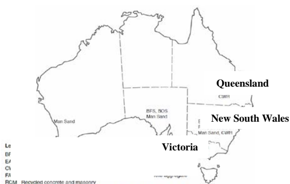
Fig.1: Sources of RCA in Australia [14]

Choosing RCA can be considered as a smart option because it is about extracting value from existing resources that would otherwise be wasted while reducing the need to dig up more virgin rocks. Even if it be assumed that there is no physical shortage of rocks in Australia, a range of social and environmental issues can be associated with the quarrying of virgin materials. Based on a life cycle analysis undertaken by the RMIT University, sustainable aggregates made from RCA have a 65% lower greenhouse emissions impact than similar products made from virgin rocks across the full product lifecycle, largely due to avoiding the energy needed to quarry rock.